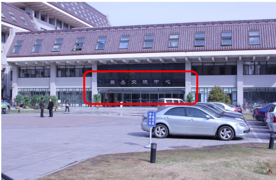
Photo 2 Find Yingjie Conference Center on your right hand.