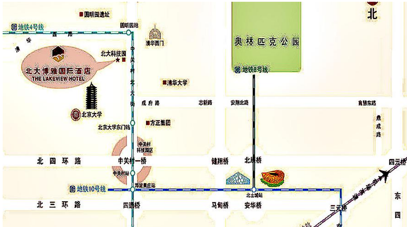
Map2 Travelling Route from the airport to Lake View Hotel