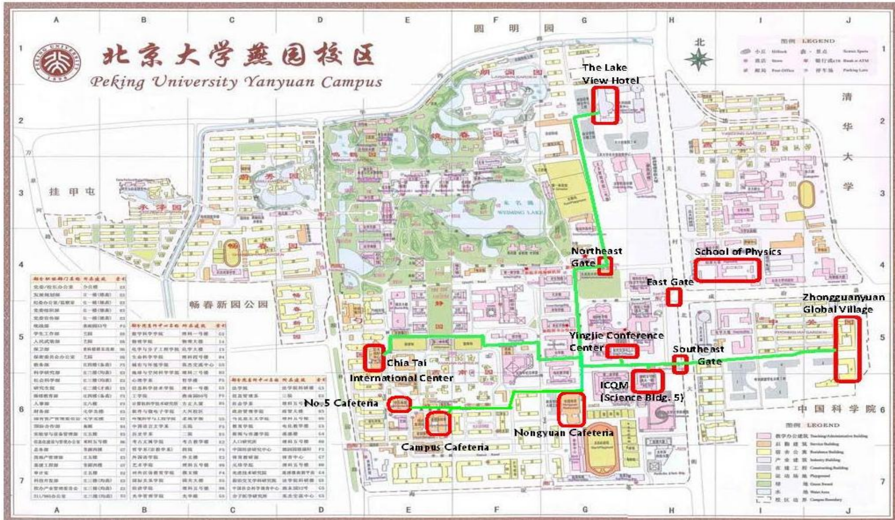
Map1 Peking University Campus

Please refer to map 1 and photos for Press Hall, Yingjie Conference Center